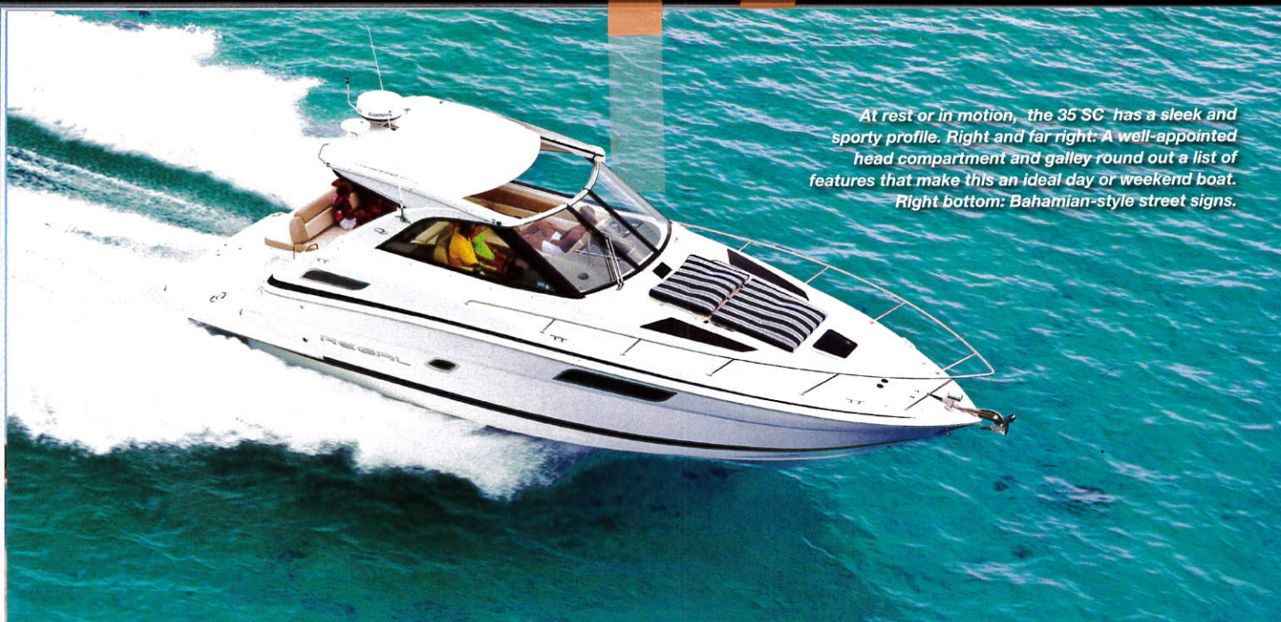
At rest or in motion, the 35 SC has a sleek and sporty profile. Right and far right: A well-appointed head compartment and galley round out a list of features that make this an ideal day or weekend boat. Right bottom: Bahamian-style street signs.